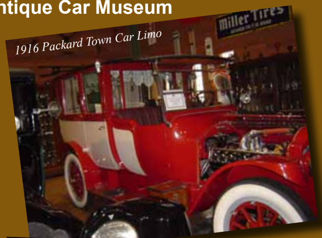
1916 Packard Town Car Limo

I recently visited the Ft Lauderdale Antique Car Museum in Ft Lauderdale, FL. The Museum is dedicated to the History of the Packard Motor Company and features mostly pre war Packards. Besides Packards the museum is also filled with numerous other automotive memorabilia, such as Mascots and hood ornaments literature, brass era headlamps, and even and FDR memorabilia room. There is also a small theater in the museum that plays history of Packard videos. Most impressive however are the cars themselves. Since I myself am partial to Pre-war vehicles in general I thoroughly enjoyed this museum's collection. The collection ranges from a 1909 Packard to a 1957 Packard, the last year for Packard production. Some of the more unique Packards included a 1916 Packard Model 1-35 Twin-Six Town Car Limo (Body by CP Kimball) (the only one know to exist), a Police Patty Wagon, a Packard Fire Truck, a Packard tow truck conversion and my personal favorite a 1938 Packard Funeral Flower car which was in spectacular condition. There was also a 1929 Dual Cowl Phaeton which was impressive and the engineer in me liked the bare 1937 Packard chassis and drivetrain. Please enjoy the photos I took of the museum, including my 90 year old grandfather in front of the Patty Wagon.