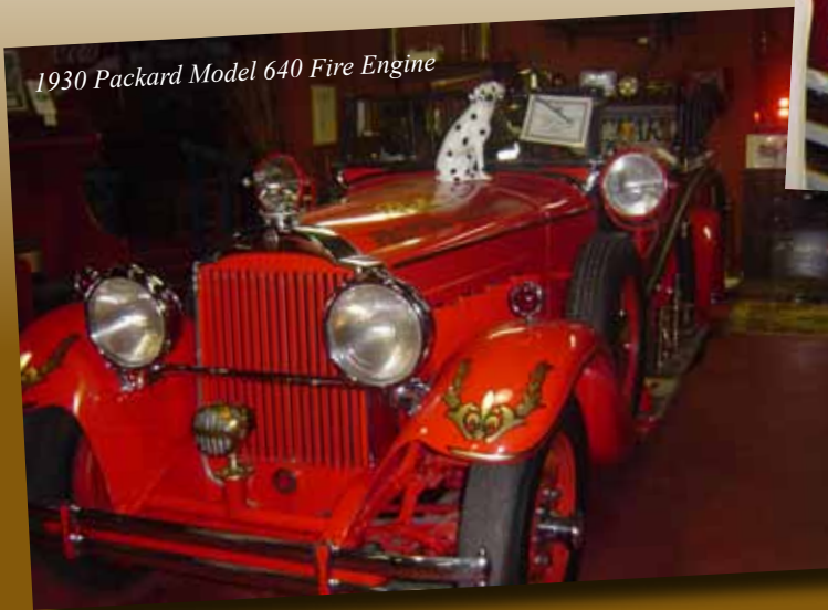
1930 Packard Model 640 Fire Engine