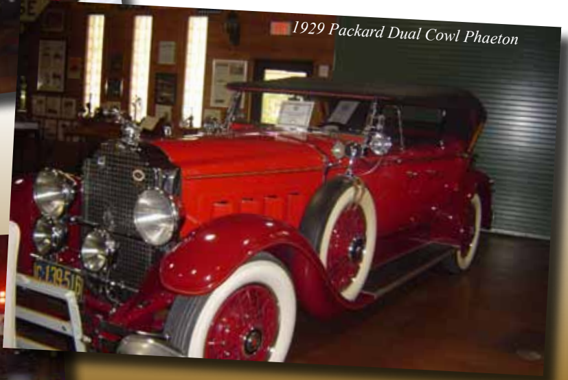
1929 Packard Dual Cowl Phaeton