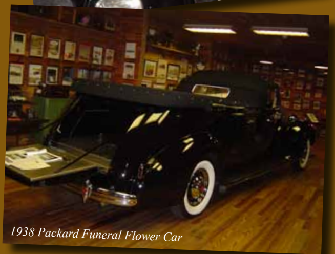
1938 Packard Funeral Flower Car