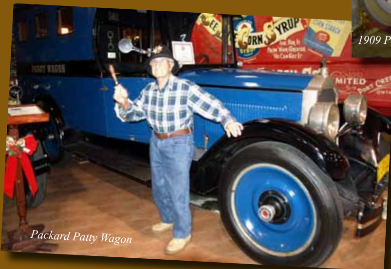
Packard Patty Wagon