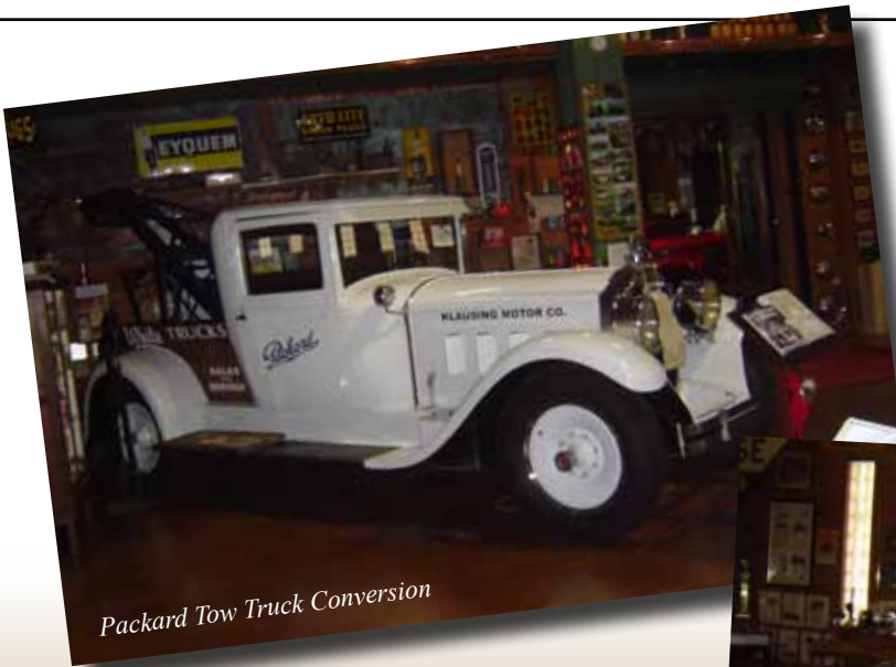
Packard Tow Truck Conversion