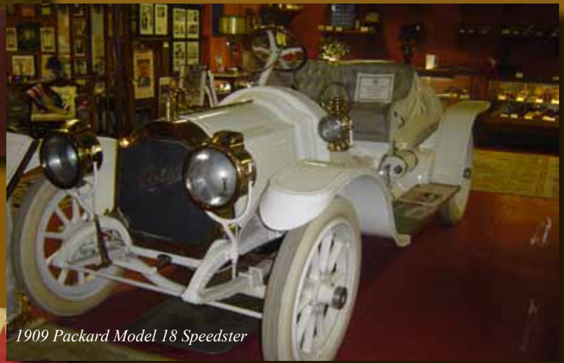
1909 Packard Model 18 Speedster